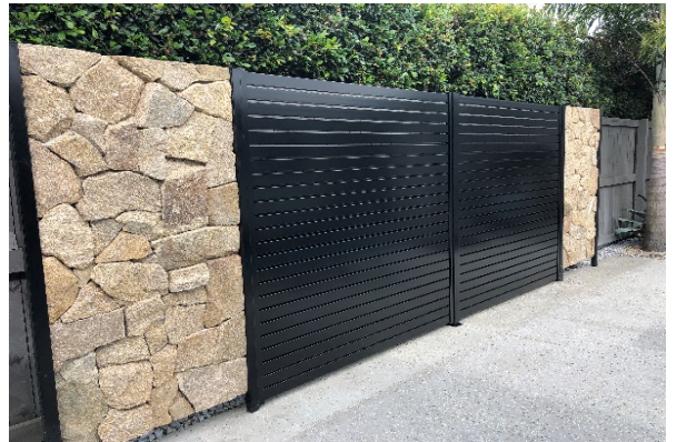
Aluminium Screening & Gates

Your Local Trade Supplier for an extensive range of quality products at the lowest prices.