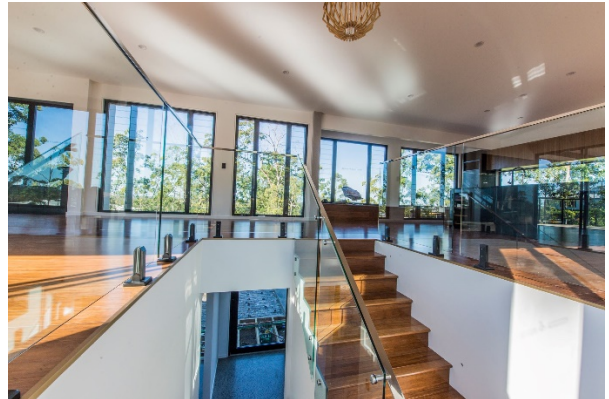
Balustrades & Stairs